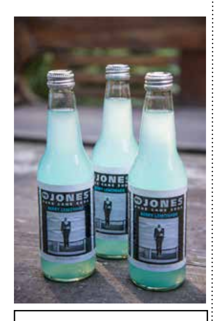
Jones Soda selects six images from our exhibit each year and features them on 250 000 bottles of their soda.