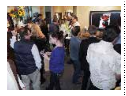
Museum Quality Framing hosts a huge crowd on opening night. Guests enjoyed refreshments compliments of Jones Soda.